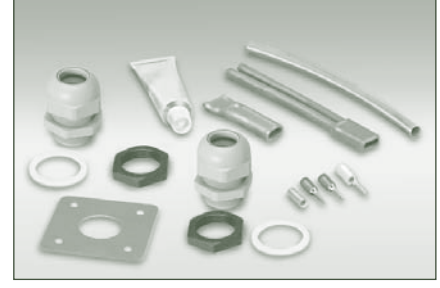
PETK-SXM-OJ-IND... circuit fabrication kit terminates SX heating cables in a JB-K-1 (or other) junction box. Kitincludes an M25 tracer gland (with locknut), power boot, end cap, RTV adhesive, yellow/green earth wire sleeve, the necessary wire pins/lugs plus an insulation entry kit.