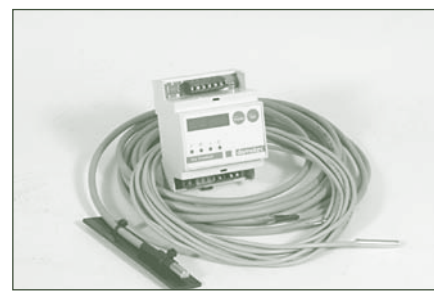
DHB 350.. ice-control, 230 Vac, 13A consisting of a combined control unit with humidity and temperature probe. The control unit switches the heating cable on when the ambient temperature is below 3 deg. C, and icy water/snow is present in the gutter.

Note: Separate kit required to connect RGS cable to the DHB fitting, must order separate. SXM kit for DHB10X