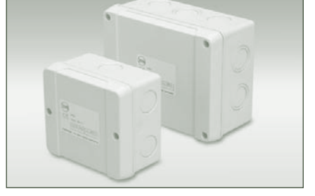
JB-K-1, JB-K-2...rugged, impact-resistant nonmetallic junction boxes for use in nonhazardous environments and have an IP65 degree of protection.