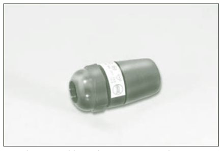
ESC... heating cable end connection. End connection made of plastic with enclosed silicone socket. The heating cable is clamped mechanically and the tensile strength is guaranteed.