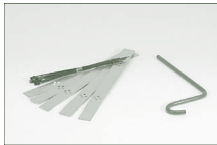
KS-1...edge protection for down pipe and snow rail.Heating cable mounting for north light guttering.HT-1...heating cable mounting for eaves tile.